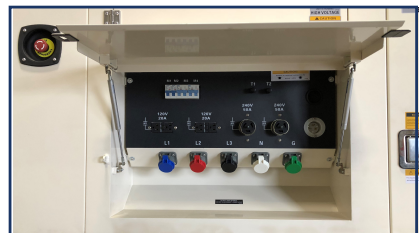
CUSTOMER CONNECTION CAM-LOCK STANDARD