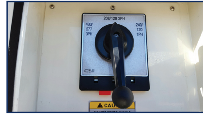
3 POSITION VOLTAGE SELECTOR SWITCH