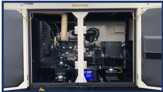
EASY ACCESS FOR MAINTENANCE