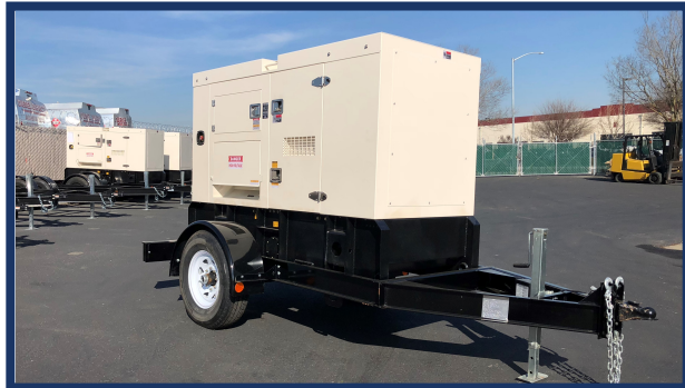
LARGE CAPACITY FUEL CELL

UQ-40: Standby Rating: 38 kVA / 30kW Prime Rating: 35 kVA / 28kW